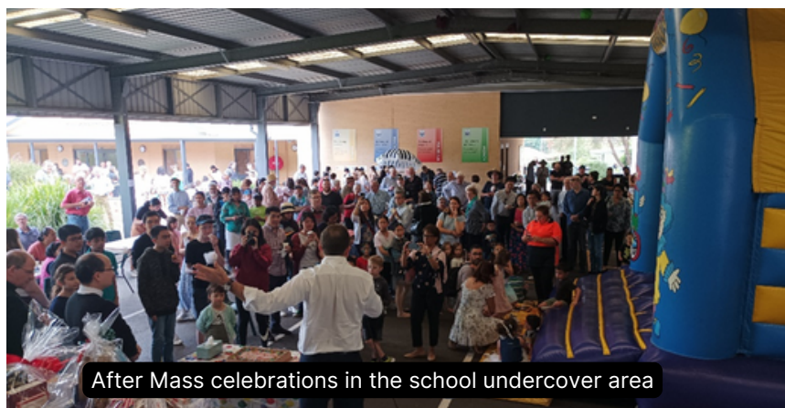
After Mass celebrations in the school undercover area

..... continued from previous page - more photos of celebrations