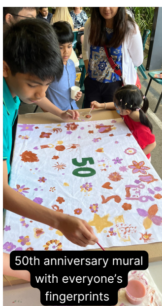
50th anniversary mural with everyone's fingerprints