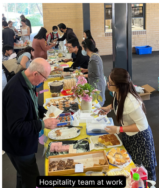
Hospitality team at work